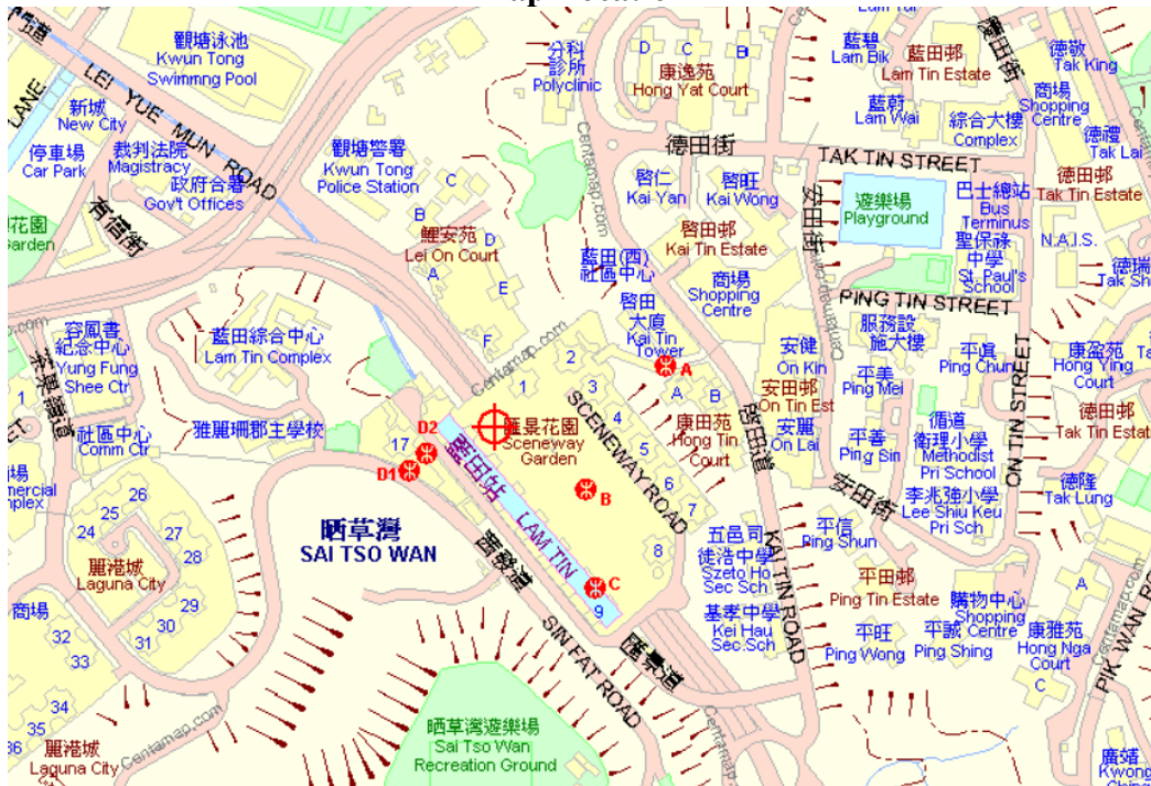
Entrance of Sceneway Plaza of Level 4 (from MTR & Kai Tin Road)